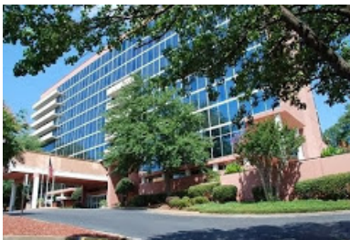
Radisson Hotel Atlanta NW 1775 Parkway Place SE, Marietta, GA, 30067 (Less than a mile from conference venue)

Special hotel discounted rates (at least for two hotels) will be secured for DCA 2020 registered participants at a later date. Tentative 2020 DCA Conference Hotel Options will be Hilton, Radisson, and Marriott (Renaissance Waverly), all within 1 to 6 miles from conference venue. Free shuttle services from conference hotel to conference venue will be provided at scheduled times. Please visit conference website at www.dcaconference2020.org for updated information on hotel options.