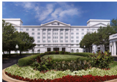
Hilton Atlanta/Marietta Hotel & Conf Center 500 Powder Springs St, Marietta, GA 30064 (About 2 miles from conference venue)